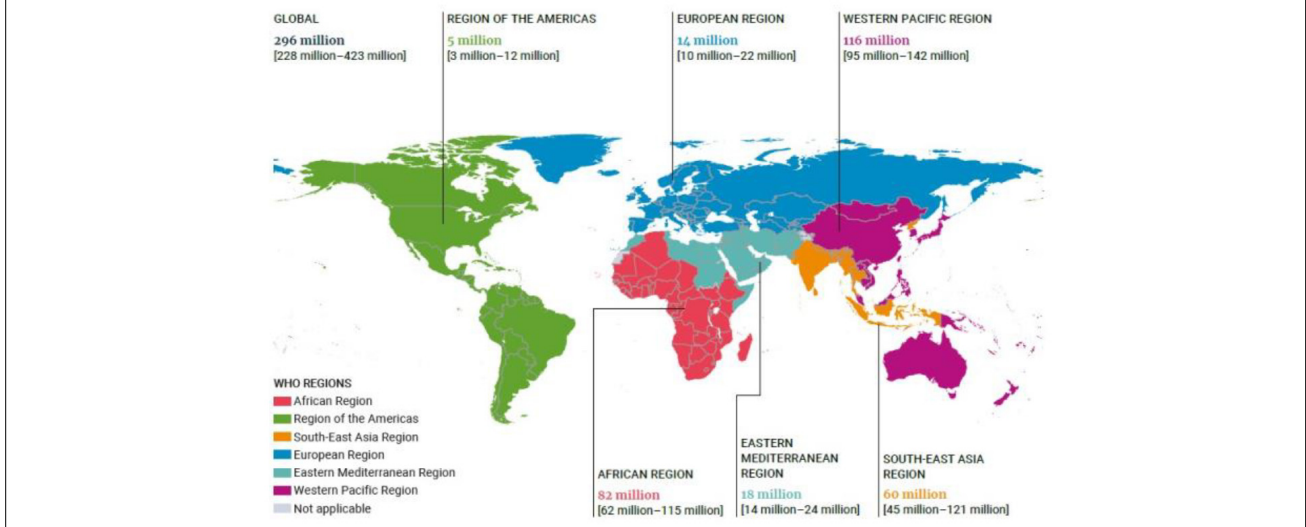
Fig. 1. Prevalence of HBV infection in general population by WHO region (Global progress report on HIV, viral hepatitis and sexually transmitted infections, 2021).

Mother-to-child transmission of hepatitis B continues to be a major mode of transmission [5]. Other reasons for the increase of HBV worldwide are: Increasing costs of care and medical services, lack of proper political interactions, lack of information and strategic surveys, lack of a meticulous action plan, and shortage and cost of diagnosis [6].