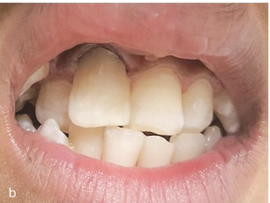
Figure 2a: Therapeutic procedure included complete removal of the lesion, b: Aesthetic correction with composite material