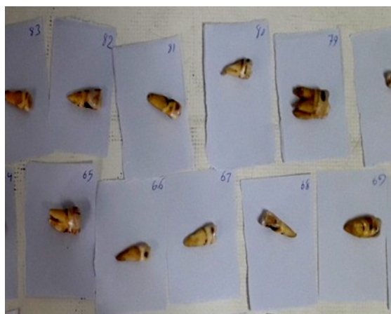
Figure 1. Samples dried at 100°C for 2h.

Where \rho and \rho_b are the number of alpha tracks of the samples (track cm -2 ) and the number of background tracks in the CR-39 detector, respectively, k is the conversion coefficient of 0.0878 track cm -2 Bq -1 day -1 m 3 used to convert alpha track density into radon radioactivity concentration, and t is the exposure time (days). The background track density analysis was performed on a blank detector stored alone.