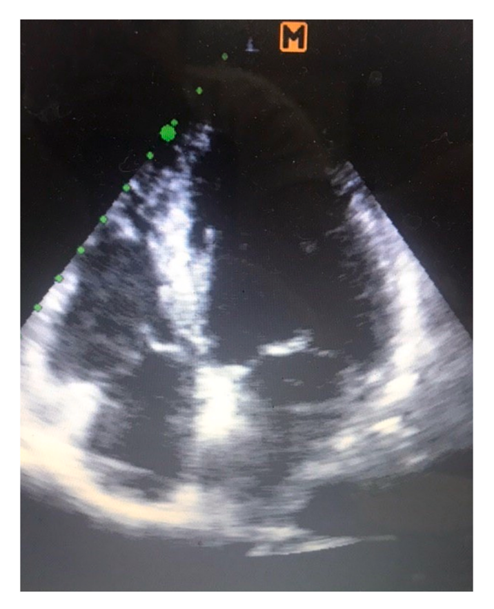
Fig. 2. Inter-ventricular septal thickness.

Written informed consent was obtained from the patient for publication of this case report and accompanying images. A copy of the written consent is available for review by the Editor-in-Chief of this journal on request.