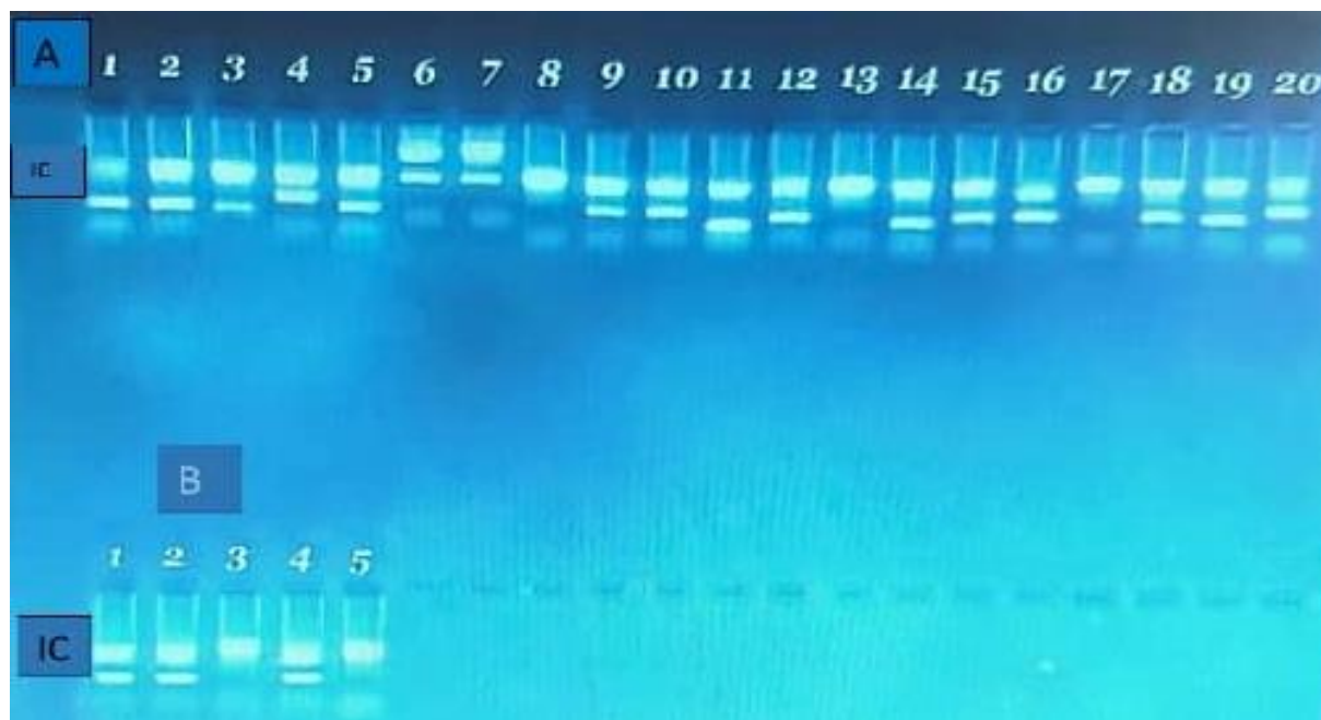
Fig. 1. Gel electrophoresis of the PCR products. A) KIR genes including 1: 2DL1, 2: 2DL2, 3: 2DL3, 4: 2DL4, 5: 2DL5A, 6: 2DL5B, 7: 2DS1, 8: 2DS2, 9: 2DS3, 10: 2DS4-full, 11: 2DS4-del, 12: 2DS4-del(008), 13: 2DS5, 14: 3DL1, 15: 3DL2, 16: 3DL3, 17: 3DS1, 18: 2DP1, 19: 3DP1-full, 20: 3DP1-del. B) HLA genes including 1: C1, 2: C2, 3: Bw4T, 4: Bw4I, 5: A Bw4.