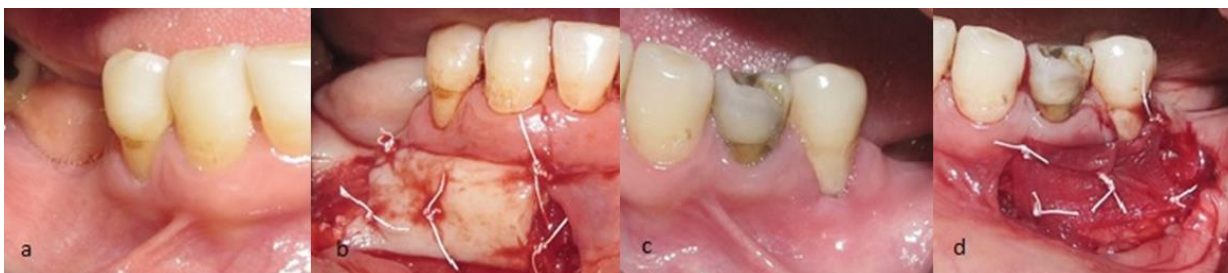
Fig. 1. Gingival augmentation by free gingival graft (FGG) on the right side (a and b) and mucograft on the left side (c and d)

The patients were numbered according to when they had presented to the department. After the patients' eligibility for enrollment in the study was confirmed, all the surgeries were done according to the patients' numbers. Concealed allocation was performed by using sealed, coded envelopes that were opened just before surgery to determine the test (Mucograft®) and control (FGG) groups. To allow for possible dropouts, 12 patients were recruited. One experienced surgeon, who was blinded to the randomization sequences, performed all surgeries.