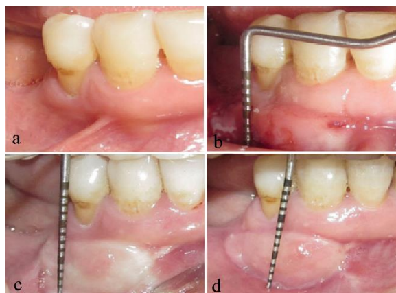
Fig. 2. Free Gingival graft: (a) Before surgery. (b) 30 days after surgery. (c) 90 days after surgery. (d) 180 days after surgery