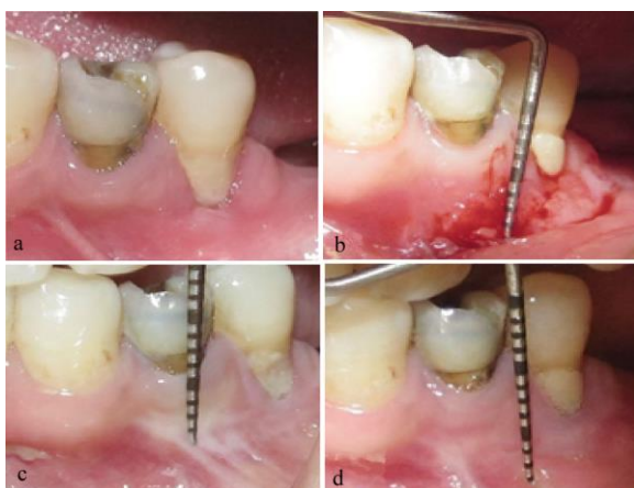
Fig. 3. Mucograft: (a) Before surgery. (b) 30 days after surgery. (c) 90 days after surgery. (d) 180 days after surgery

The width of keratinized gingiva was evaluated using a UNC-15 probe in millimeters and recorded preoperatively and at intervals of 1, 3, and 6 months after surgery. Because one person performed both interventions, the obtained data were correlated, and two-way repeated-measures ANOVA was used. P-values less than 0.05 were considered significant. The difference in keratinized gingival width between two groups of FGG and CM was statistically significant, regardless of the intervention time. It should be noted, however, that in the CM group, the keratinized gingiva was less than that in the FGG group. The mean dimensional change of keratinized gingiva 6 months postoperatively was 4.1 \pm 0.7 mm for FGG and 8 \pm 1.7 mm for CM (Fig. 2 and 3).