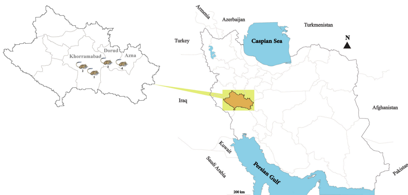
Fig. 1 Map of rodent collection sites in Lorestan province, Iran; Numbers stand for the sites summarized in Table 1

Sequences were manually checked using FinchTV ® software ( www.geospiza.com ) to modify any probable source