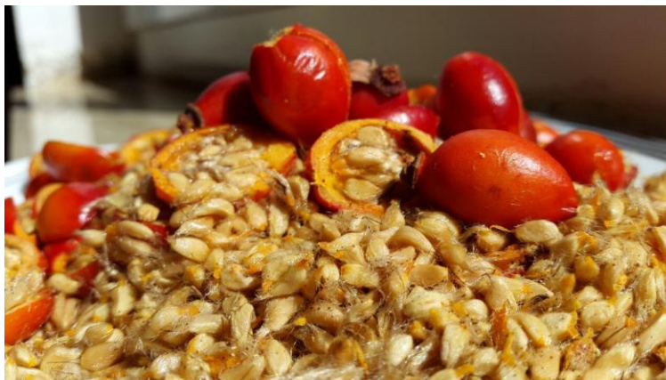
Figure 2. Rose hip of Rosa canina L.