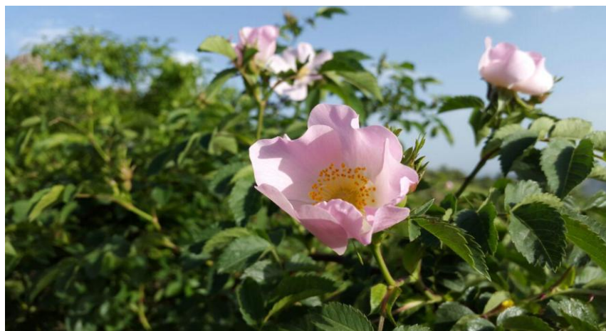
Figure 1. Rosa canina L. flower in Sarab-e Robat, Lorestan, Iran.

humulene (1.01-10.16 \mu\text{g/kg} ) were identified (24).